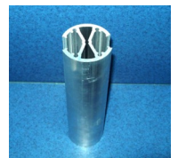
2 Way Post